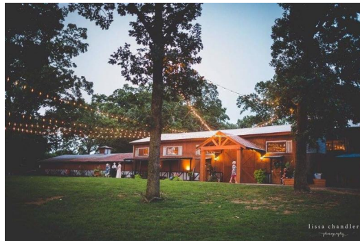
"The Barn at the Springs"